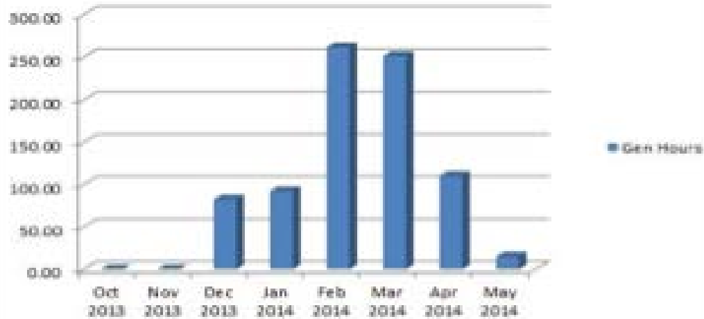
Seeding Events by Month